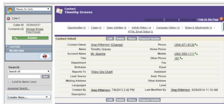
Example of UC suite integrated with Salesforce.com

UC Suite is easily installed on any personal computer or laptop from a web-browser. Employees can download and install the UC Suite software directly from their browser. Your IT personnel no longer have to go from one computer to the next with a USB drive to complete installation. UC Suite direct download saves IT time and increases efficiency.