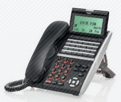
DT430 & DT830